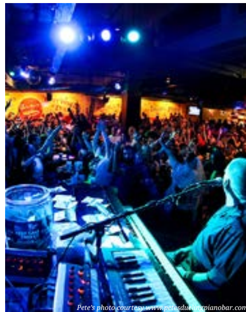
Pete's photo courtesy www.petesduelingpianobar.com