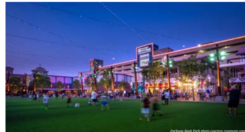
Parkway Bank Park